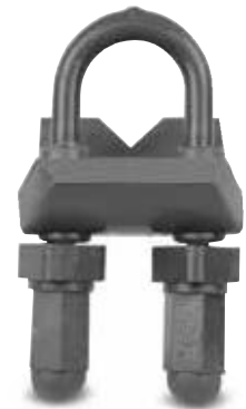
Right Angle (RA)